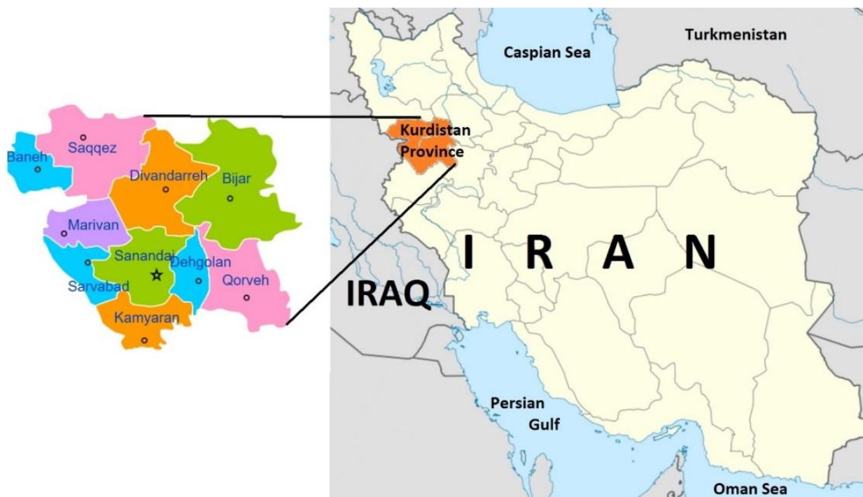
Fig. 1. The study area, Kurdistan Province is located in west part of Iran

The coordinates of collection sites have presented in Table 2.