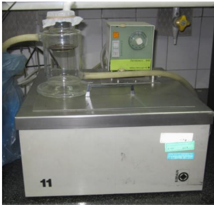
Fig. 1. Tick artificial feeding apparatus

Among the tested membranes, the chicken skin was the best and the heparinized blood had the most efficient because it was not clotted even after 4h. No preference among the tested blood was observed.