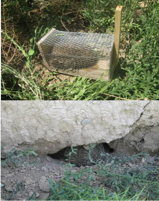
Fig. 1. The hedgehog captured in wire trap set up at rodent's burrow entrance and the animal found in a resort in the radix of an ancient wall surrounding the city