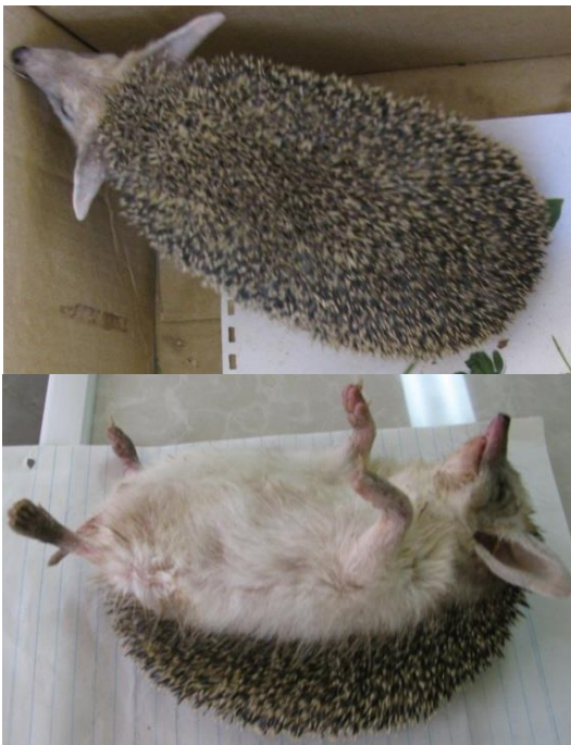
Fig. 2. The examined hedgehogs in dorsal and ventrolateral view