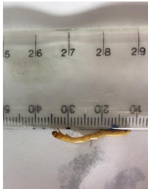
Fig. 2. Macroscopic examination of the larva