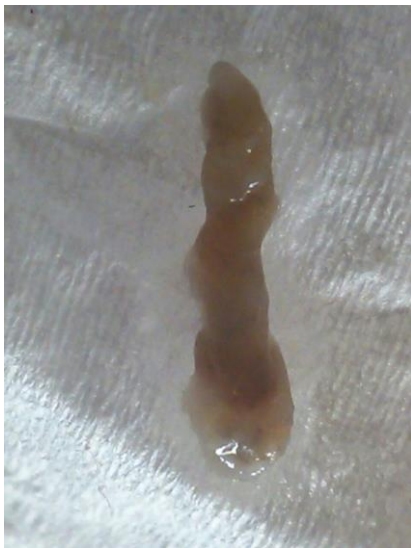
Fig. 4. Disposal shell of insect after treatment by ivermectine