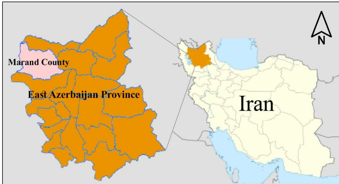
Fig. 1. Map showing Iran, highlighting the location of East Azerbaijan Province and Marand County