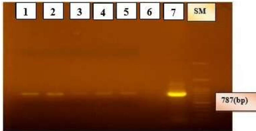
Fig. 4. Gel electrophoresis of the PCR product of Plasmodium small subunit ribosomal DNA gene, No. 1, 2, 3, 4 and 5: Positive samples of ducks. No. 6: Negative control, No. 7: Positive control, SM: Size marker. A 787bp band corresponding to Plasmodium infection is shown in duck birds in comparison of the positive control