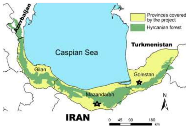
Fig. 1. Sampling sites (section of Iran): Mazandaran and Golestan Provinces. Stars show collection sites