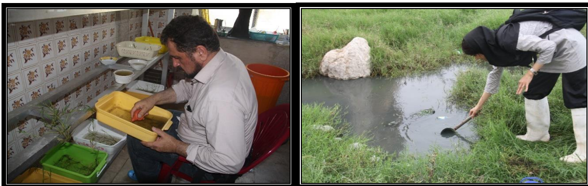
Fig. 2. Collection of immature Culex quinquefasciatus from natural breeding places with floating Bermuda grass and subsequent establishment in the insectary of Bandar-Abbas Health Training and Research Station, Persian Gulf littoral, Iran