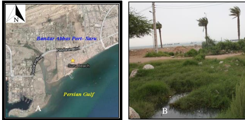
Fig. 1. A. Satellite map of Suru location, Bandar-Abbas Port, Hormozgan Province, Persian Gulf littoral, Iran b. Ground landscapes of the breeding places of Culex quinquefasciatus in study area