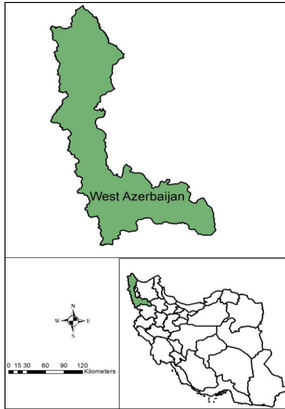
Fig. 1. The status of study area, West Azerbaijan Province in Iran