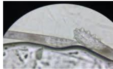
Fig. 1. Demodex folliculorum detected in a positive patient in Urmia Taleghani Hospital, 2018 (Original)

In the survey asking whether common substances were used, 21 out of 246 patients stated that they used common substances, and mites were detected in 46.7% (10) of them and in 14.7% (33) of those who did not use public goods. Statistically, the use of common items increases demodicosis ( p=0.001 ). It was determined that 16 of the individuals were on hemodialysis due to kidney failure. Demodicosis was detected in 37.5% of these patients and 16.1% of those who did not receive hemodialysis ( p=0.008 ).