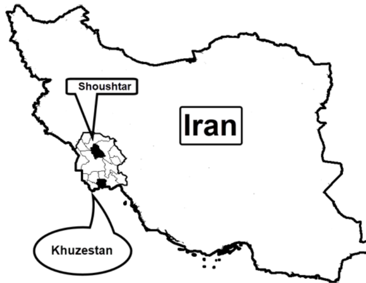
Fig. 1. The area of this research is Shoushtar County (Khuzestan Province) in Iran's southwest 2015