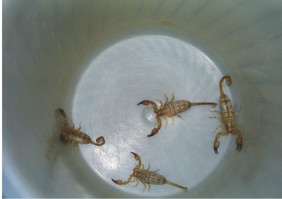
Fig. 1. Photo of four live Hemiscorpius lepturus (Hemiscorpiidae) in Iran