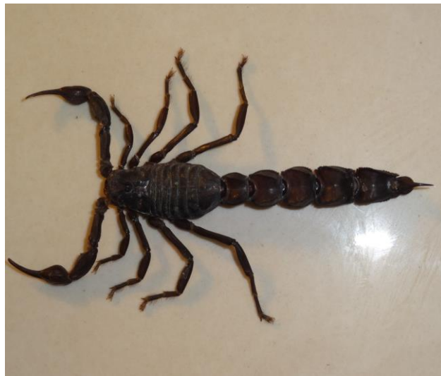
Fig. 3. Photo of a Androctonus crassicauda (Buthidae) in Iran