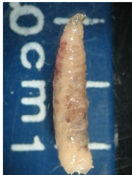
Fig. 2. Macroscopic aspect of a larva