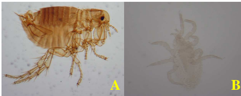
Fig. 2. Ectoparasites collected from R. opimus in the study area: A: Xenopsylla nuttalli and B: Ornithonyssus bacoti

Totally 50 R. opimus were captured and 97 specimens of ectoparasites were observed. Two species of ectoparasites were identified including Xenopsylla nuttalli (flea) and Ornithonyssus bacoti (mite) (Fig. 2). Xe. nuttalli was dominant (75.3%) collected specimen Fleas were found in all parts of the study areas. The most frequency of Xe. nuttalli (58.9%) was in Badrood County. The highest frequency of Xe. nuttalli was 12.33% in Habibabad, 58.9% in Badrood, 6.85% in Esfarayen, 5.48% in Shirvan, 2.74% in Shahrood, 4.1% in Damghan and 9.59% in Kalaleh. The most frequency of Ornithonyssus bacoti (54.16%) was found in Esfarayen County. This species was not observed in Kalaleh, Habibabad and Badrood. The frequency of Or. bacoti was 54.16% in Esfarayen, 20.83% in Shirvan, 12.5% in Damghan and 12.5% in Shahrood (Fig. 3).