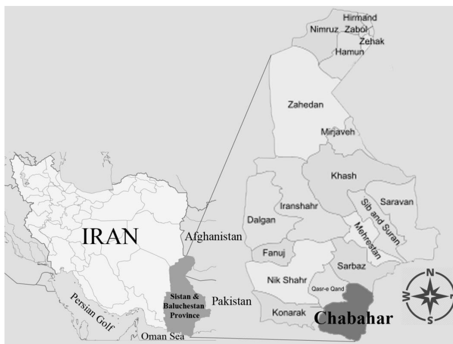
Fig. 1. The map of the study area in Chabahar Seaport, Southeast of Iran